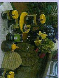
Free tasting of Organic Honey & Honey Mead