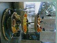
Glorious High Tea