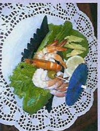
Yummy Lunch Gluten Free & Vegan food