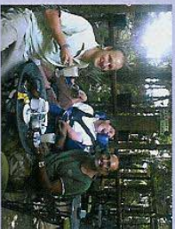
Wheel Chair Access